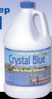
Crystal Blue® Lake and Pond Treatment