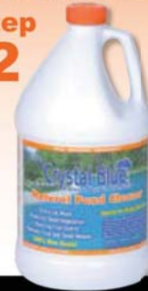
Natural Pond Cleaner Lake and Pond Cleaner