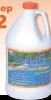
Natural Pond Cleaner Lake and Pond Cleaner