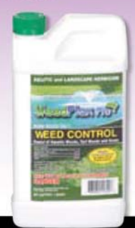
WeedPlex Pro Aquatic Herbicide