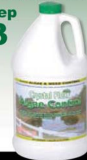
Crystal Plex® Aquatic Algaecide/Herbicide